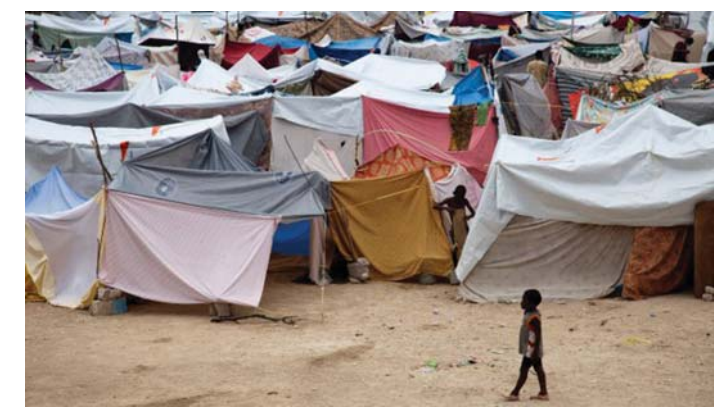
My Haiti Solidarity Holiday En route to camp, the aftermath of the earthquake of 12 January 2010 is still visible with many people who lost their homes living in tents over a still visible with many people who lost their homes living in tents over a