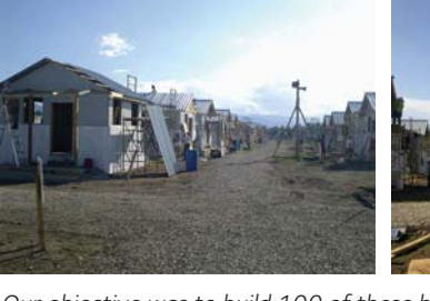
Our objective was to build 100 of these homes before the end of the week. (This photo is showing the houses almost at completion. When we got there there was only the foundation and the walls (white) constructed up to about a metre and a half. The enthusiasm and dedication that the volunteers displayed in trying to achieve this was a sight to behold – and this with no supervisor standing over your shoulder, and, sweltering heat and humidity to contend with.

Here is the camp that we called home for a week. The green stretcher