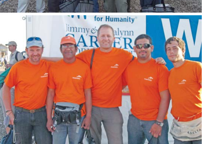
The full ArcelorMittal team: We had representatives from Africa, Trinidad, the USA (including a Mexican working in the USA), Spain, Germany, Belguim and France and it was especially fascinating and mind-boggling at how we gelled together and got on like family although we only met for the first time at Atlanta. It just goes to show that no matter where