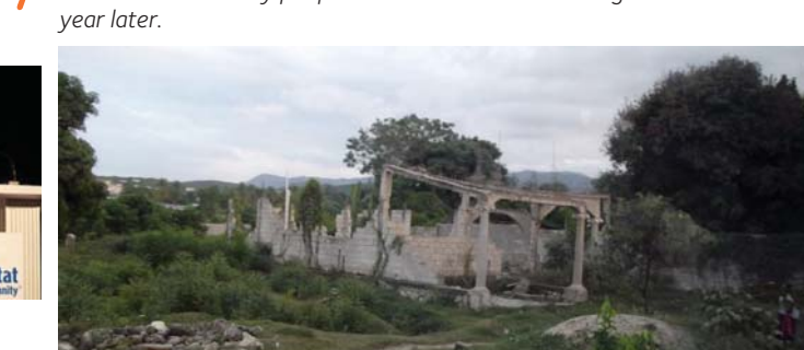
President of the United States wreaked was prevalent. Haiti is a very poor and destitute country, with this poverty visible everywhere making the plight of the Haitians even more pitiful. In some cases the rubble is still lying where the buildings fell

because there is no money to remove them